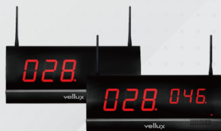
Pager Relaying Monitor VM2100 / VM2200