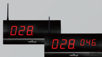
Receiving Only Monitor VM1100 / VM1200