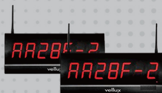
7-Digit Monitor VM1700 / VM2700