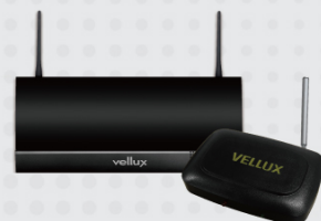
Pager Relaying Transmitter VM5000 / VM5000mini